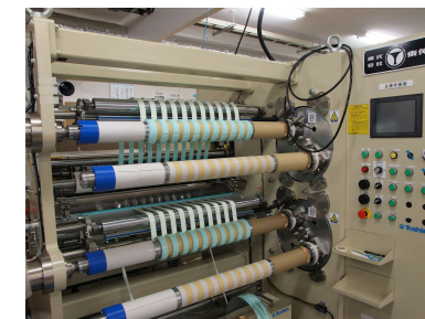
▲Slitter (for narrow width)