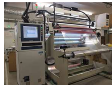
▲Rewinder (with contamination detector)